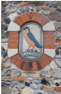
Lacons brewery symbol

This is a wooden conservatory-type structure sat towards the end of the pier. Plenty of glass and the pale blue paintwork makes the single room bright and cheery. Furniture is modern wood and plastic and there are 360 degree views of the town, cliffs and sea. Three Lacons beers to try: Falcon, Norfolk Gem and Legacy. (A bit pricey at £6 a pint.)