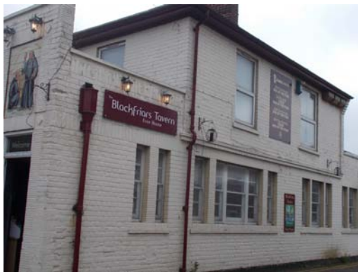
The Blackfriars Tavern

Not far from the Red Herring, at the end of a section of the town walls, next to the Blackfriars Tower, sits the BLACKFRIARS TAVERN . This is a street end, Victorian, terrace pub with two rooms and with a mix of traditional and modern wood furniture. At the rear is a courtyard and the Blackfriars microbrewery. Both rooms have a large selection of bottled British and Belgian beers for sale. It is a comfortable and welcoming pub. It also has a wondrous selection of board games and individual tables are set out for backgammon and chess and there is a rare bar billiards table. (Look out for the chess set with Star Wars figures!)