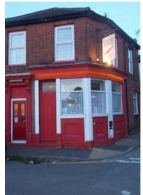
The Red Herring

The first was a corner end terrace pub, close to the Time and Tide museum. The RED HERRING is a two room house with a divided lounge and games room with pool table and darts. It has traditional furnishings, fabric bench seats,