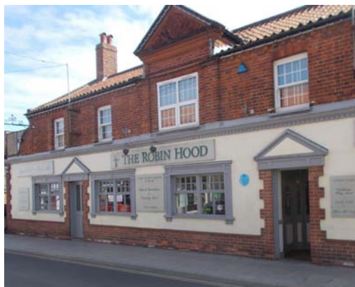
The Robin Hood

We arrived before general opening times and after a number of false starts found our first open pub in the shape of the CROWN . This is a modern open plan building painted an insipid green. Nicely furnished with a mix of benches and wood furniture and wood flooring and panelled walls. It is mainly an eatery and the beer range was Black Sheep bitter; Hobgoblin Gold; Fullers London Pride and our choice the local Lacons Legacy. It has a beer garden to the rear, adjacent to the museum and overlooking the sea.